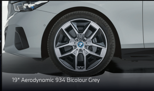
19" Aerodynamic 934 Bicolour Grey