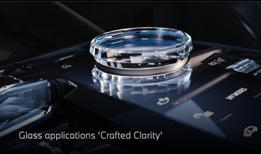
Glass applications 'Crafted Clarity'