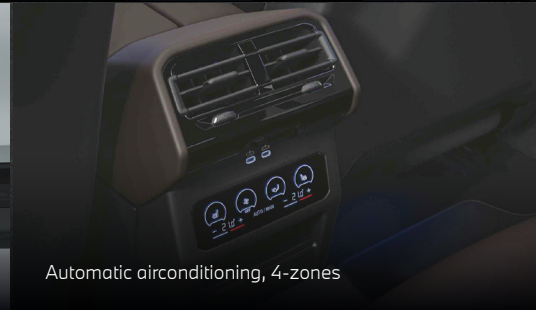
Automatic airconditioning, 4-zones