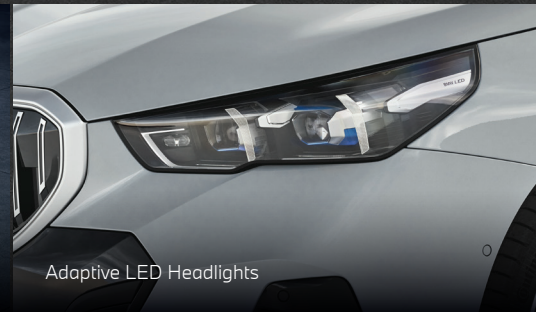
Adaptive LED Headlights