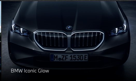
BMW Iconic Glow